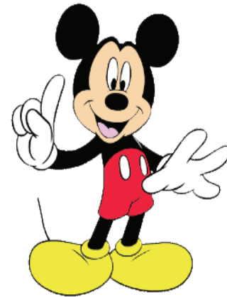
Mickey & Minnie Mouse Our Mascots

Change will always happen, and it should. Leaving and moving on aren't negative, just different. Go out and experience something new today. It'll change your life, guaranteed. Love you all and see you soon!!!!